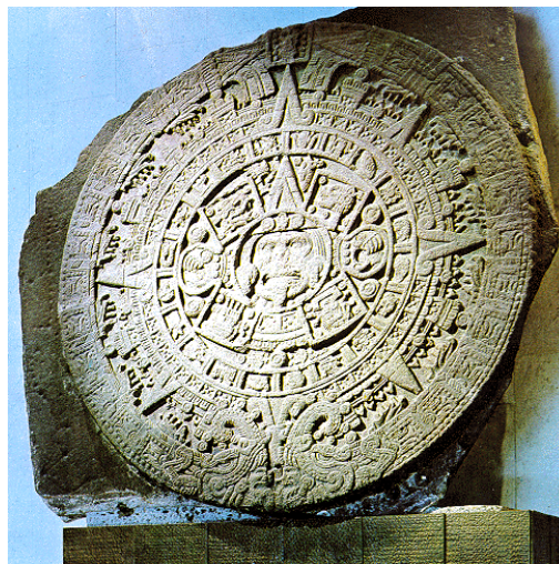
Massive Aztec "Calendar Stone"