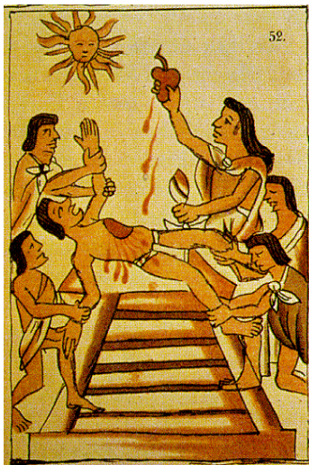
Human Sacrifice to Huitzilopochtli

Legends told the early Aztecs that their god Huitzilopochtli had made the ultimate sacrifice for them to create the sun, and set it moving across the heavens. Humans in turn were to repay that sacrifice by offering human blood and human hearts to the sun, in order to keep it rising each day and supporting human life. As their empire grew, Aztec sacrifices became more extensive, sometimes offering hundreds or even thousands of human hearts to the sun on the altars to Huitzilopochtli. Those sacrifices were usually captives taken in warfare, which raged almost constantly. The capture of an enemy in battle raised a warrior's status in the military, and in society, where he was allowed to live better and wear more elaborate clothing in recognition of his prowess.