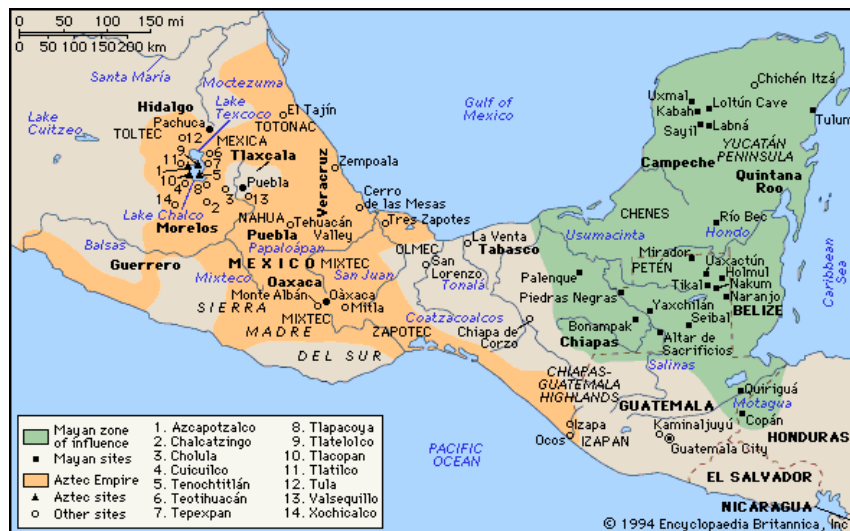
Map of Aztec Empire within Mesoamerica

One Aztec expansion technique was to send their long-distance traders ( pochteca ) to spy on a potential target state through their market systems, and send back to the capital city of Tenochtitlan for assistance. They might even foment some sort of local disruption. Then the mighty Aztec army would descend to “pacify” the upstart state, and incorporate it into the expanding empire. This process of imperial expansion and pacification was nearly constant for most of the 200 years since the establishment of the Aztec capital city of Tenochtitlan about 1325. Further trade relations connected the empire with other states well into Central America.