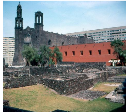
Plaza of Three Cultures: Aztec, Colonial, and Modern Mexico City