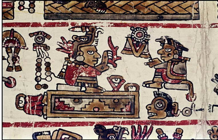
Codex Bodley: Aztec Lady 1 Monkey 'Jade Garment' (R) marries Lord 12 Rain 'Fire Serpent with Bloody Claw' (L) of Ndisi Nuu (Tlaxiaco), before 1521.

The commoners ( macehualtin ), slaves, and criminals were at the bottom of the social hierarchy. They did the work that kept the empire operating: farming and other manual labor. There were ranks within the commoners as well, depending on military successes, captives taken, political marriages, occupations, and wealth. Slaves were used mostly as servants until they took their turn as sacrifices.