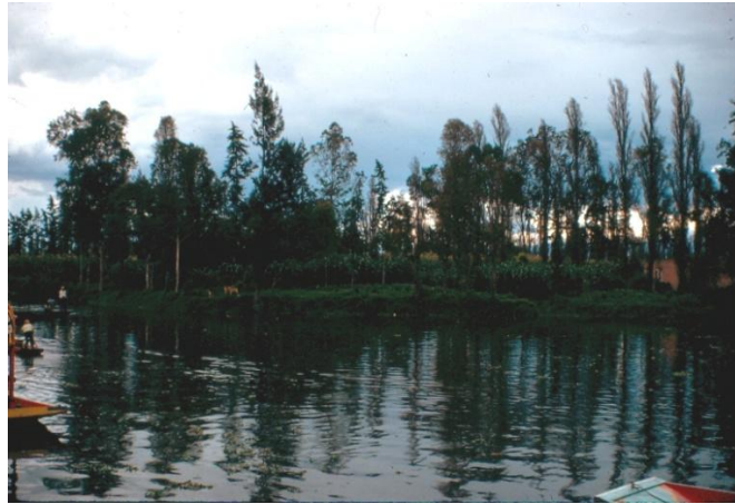
Modern Chinampas ("Floating Gardens") at Xochimilco

The city had been expanded from the original small island by bringing in stone and soil to create a foundation for more and more structures. Tenochtitlan was composed of many neighborhoods, representing various areas of the Empire. Structurally, there were four main segments, divided by main streets, each thought of as a separate city because Tenochtitlan was so big. There were central places like the Plaza Mayor, where the huge double main temple to Huitzilopochtli and Tlaloc was placed. The Templo Mayor was high enough to be seen from all over the city. This area is now called the Zócalo , Mexico City's giant government square. Another major plaza was occupied by thousands of merchants daily: this was the Great Market at Tlatelolco, where goods came in nightly from all over the Empire to feed, clothe, and provide for the city's residents.