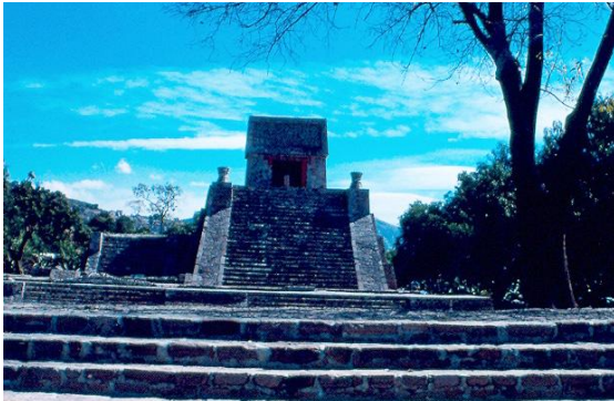
Aztec Period Temple, Tenayuca